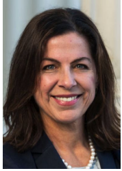
Hon. Diane Papan, Assemblymember, District 21