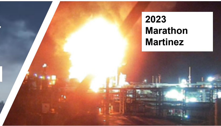
2023 Marathon Martinez