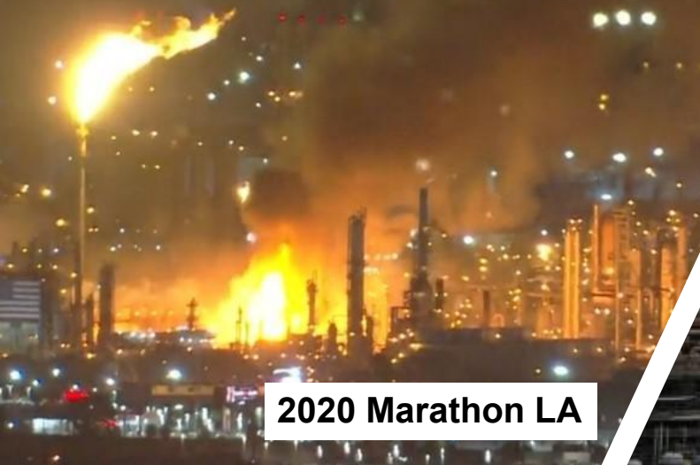
2020 Marathon LA