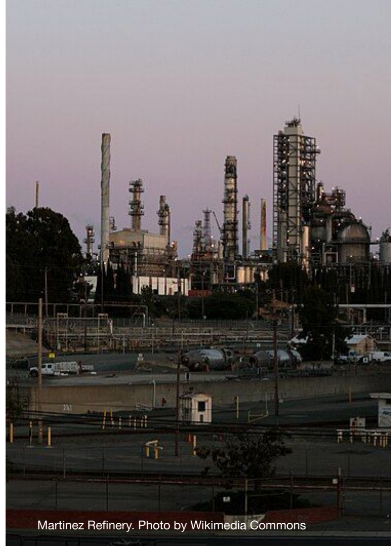
Martinez Refinery.