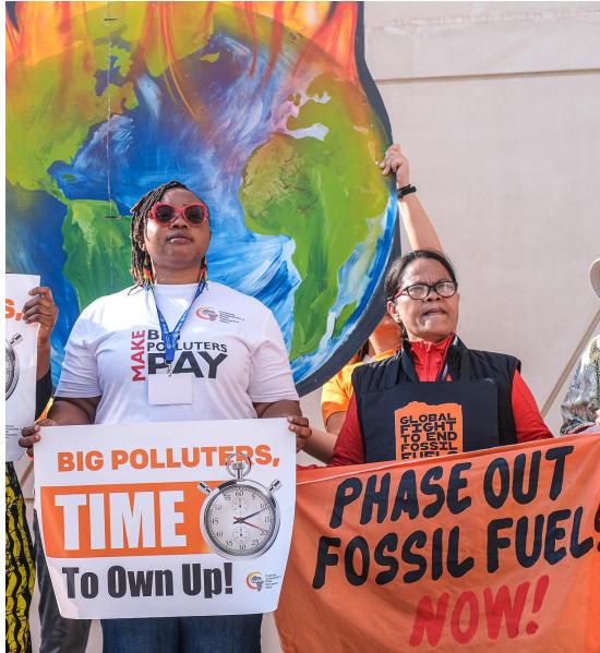
COP28 protest.

COP28: International agreement calls for a "transition away from fossil fuels in energy systems, in a just, orderly and equitable manner”