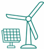
Solar & Wind