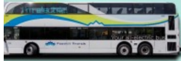
2018 Innovative Clean Transit