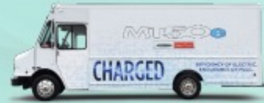
2020 Advanced Clean Trucks