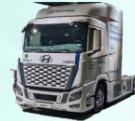
Future Zero-Emission Truck Measure