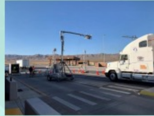
2021 Heavy-Duty Inspection and Maintenance