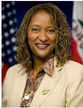
California State Senator Holly J. Mitchell.