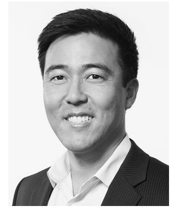
Damon Nagami Senior attorney with the Natural Resources Defense Council