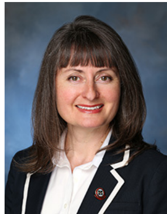
Mayor Meghan Sahli-Wells Culver City Council Member and former Mayor