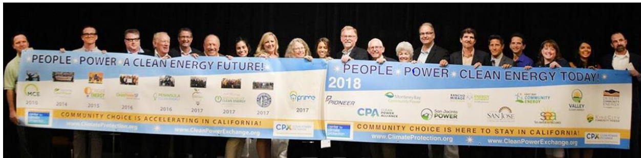
Representatives of California's Community Choice agencies at The Climate Center's annual symposium, June 2019.

The Climate Center has received numerous awards including from the EPA for "exceptional contributions to global environmental protection," from President Obama for our leadership role in establishing the first Regional Climate Protection Authority, and from the California State Senate as the Climate Advocacy Champion of the Year.