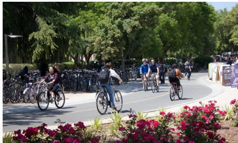
UC Davis bike commuters, Photo by Carlton Reid

Progressive rebates and other incentives for Zero Emissions Vehicle (ZEV) adoption must be increased by 2023 to achieve 50% ZEV